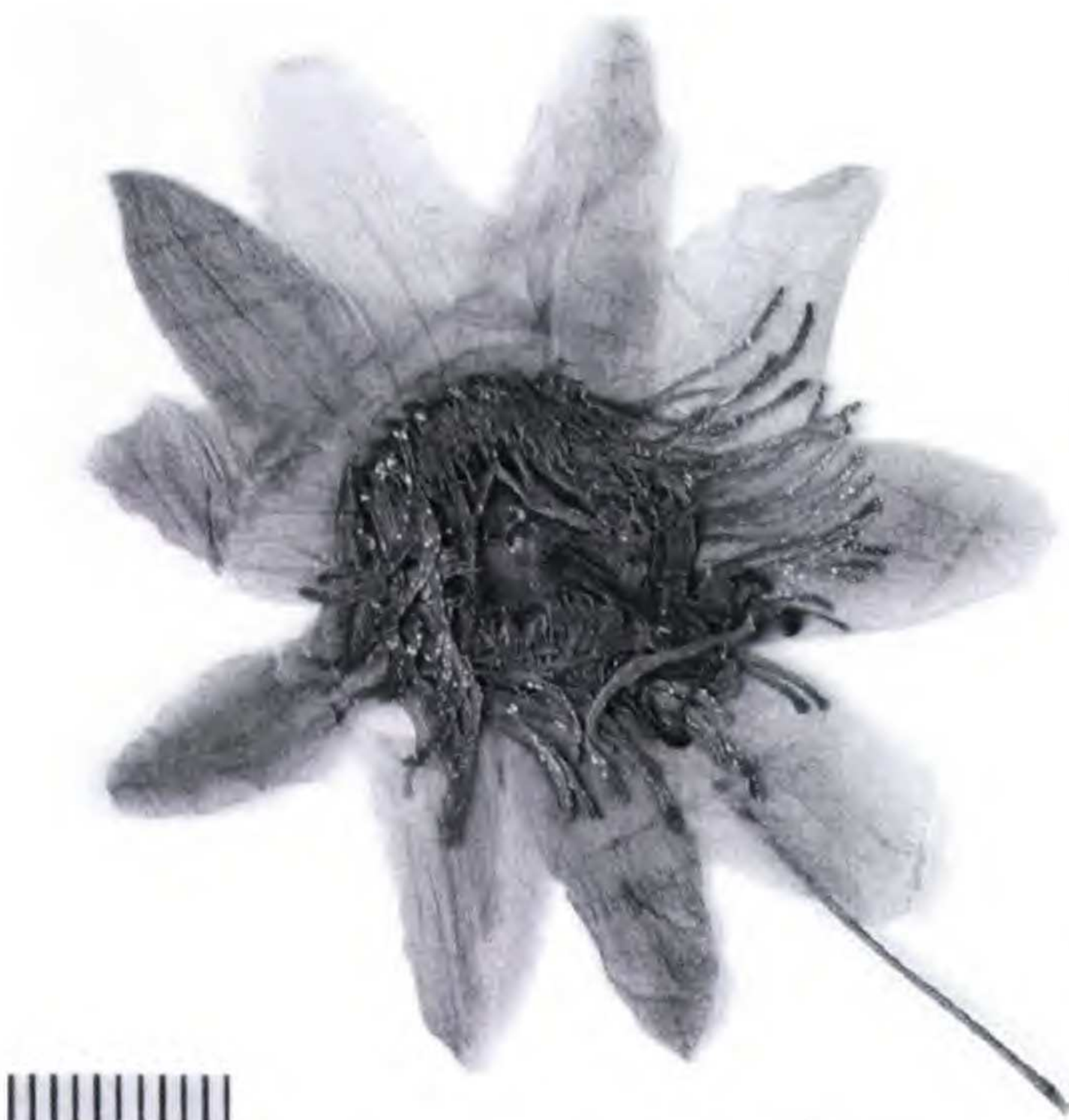
Figure 5. Passiflora pedicellaris J. M. MacDougal. A pressed dried flower from the LL holotype. Scale marked in mm.

most probably a medium-sized woody vine to canopy liana like its sisters in the section. The vernacular name, “ granadia ,” appears on the label of the type collection.